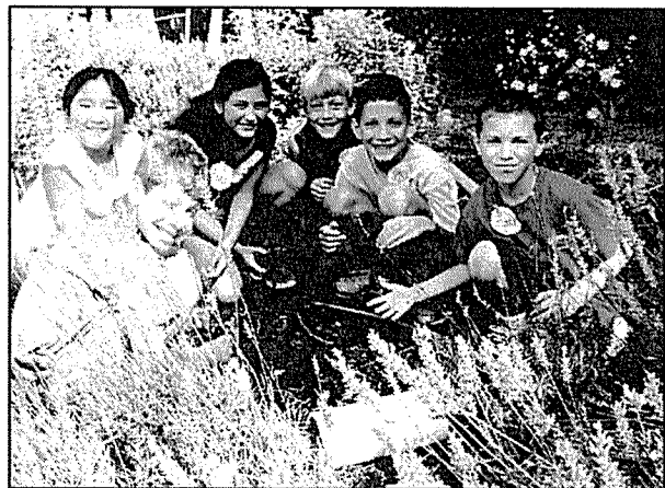
Tending to the kitchen herb garden on the historic Kissam property.

Time Travel takes on a whole new meaning! A unique summer camp designed to bring history to life!