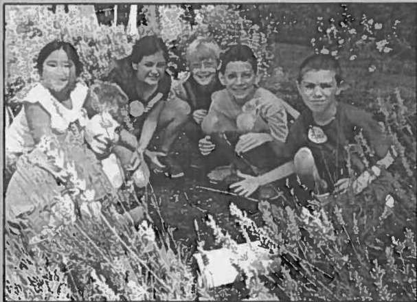
Tending to the kitchen herb garden on the historic Kissam property.

Time Travel takes on a whole new meaning! A unique summer camp designed to bring history to life!