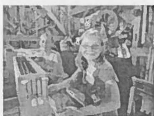
Weaving on looms

Campers will be able to wear colonial costumes, play original colonial games, tour historical sites, handle various historical artifacts that typically are viewed only behind glass displays in museums, and enjoy hands-on colonial-era activities such as: