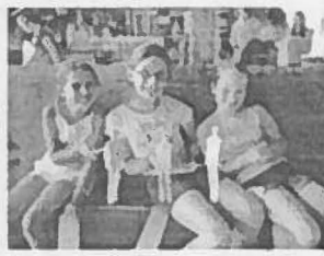
Limberjack toy making